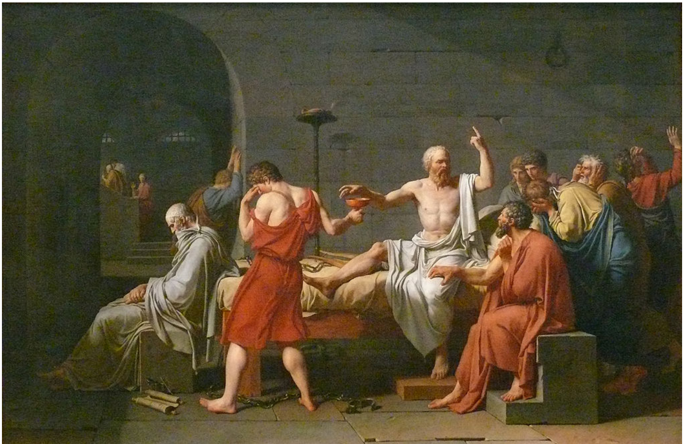
FIGURE 2 JACQUES LOUIS DAVID (1748–1825), THE DEATH OF SOCRATES IN THE METROPOLITAN MUSEUM OF ART, NEW YORK, NY. 1787 OIL ON CANVAS.

But it is now time to depart—for me to die, for you to live. But which of us is going to a better state is unknown to everyone but God.