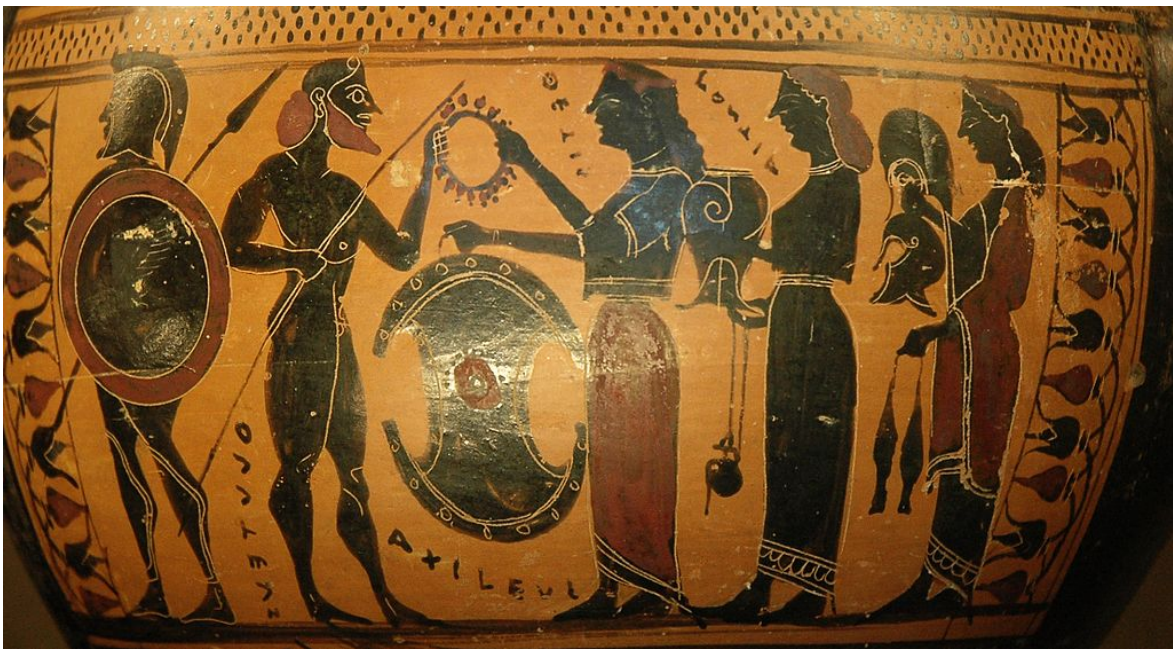
FIGURE 5 THETIS GIVES HER SON ACHILLES WEAPONS FORGED BY HEPHAESTUS, DETAIL OF ATTIC BLACK-FIGURE HYDRIA, 575–550 BC, LOUVRE

The grief of Achilles over Patroclus—The visit of Thetis to Vulcan and the armour that he made for Achilles.