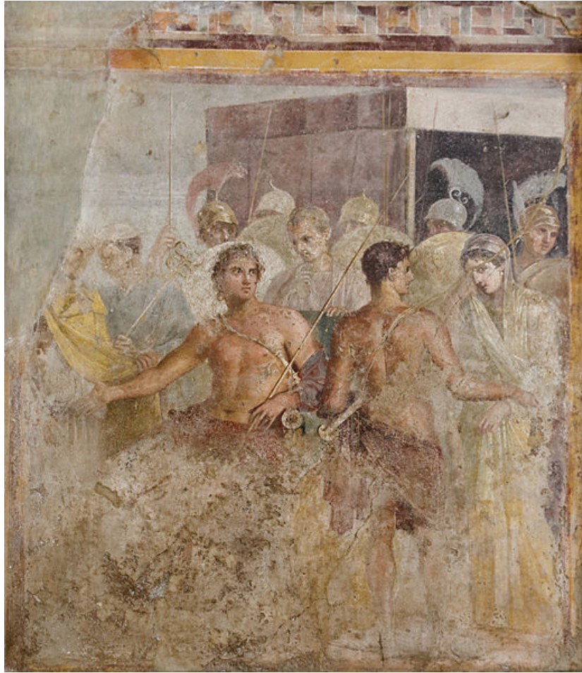
FIGURE 2 ACHILLES SURRENDERS BRISEIS, POMPEII, FRESCO, 1 ST C. CE, NAPLES ARCHAEOLOGICAL MUSEUM

The quarrel between Agamemnon and Achilles—Achilles withdraws from the war, and sends his mother Thetis to ask Jove to help the Trojans—Scene between Jove and Juno on Olympus.