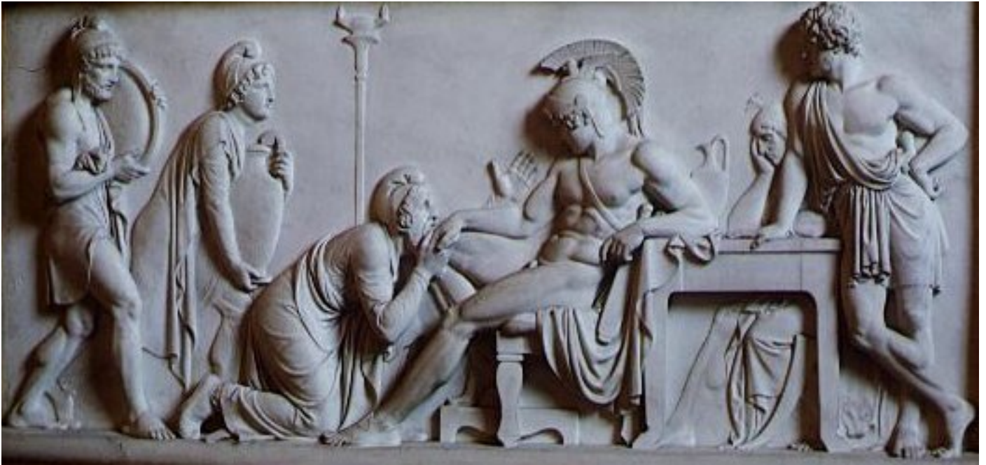
FIGURE 7 PRIAM PLEADS WITH ACHILLES FOR HECTOR'S BODY, BERTEL THORVALDSEN, MARBLE RELIEF, 19 TH C., THORVALDSENS MUSEUM, COPENHAGEN

Priam ransoms the body of Hector—Hector's funeral.