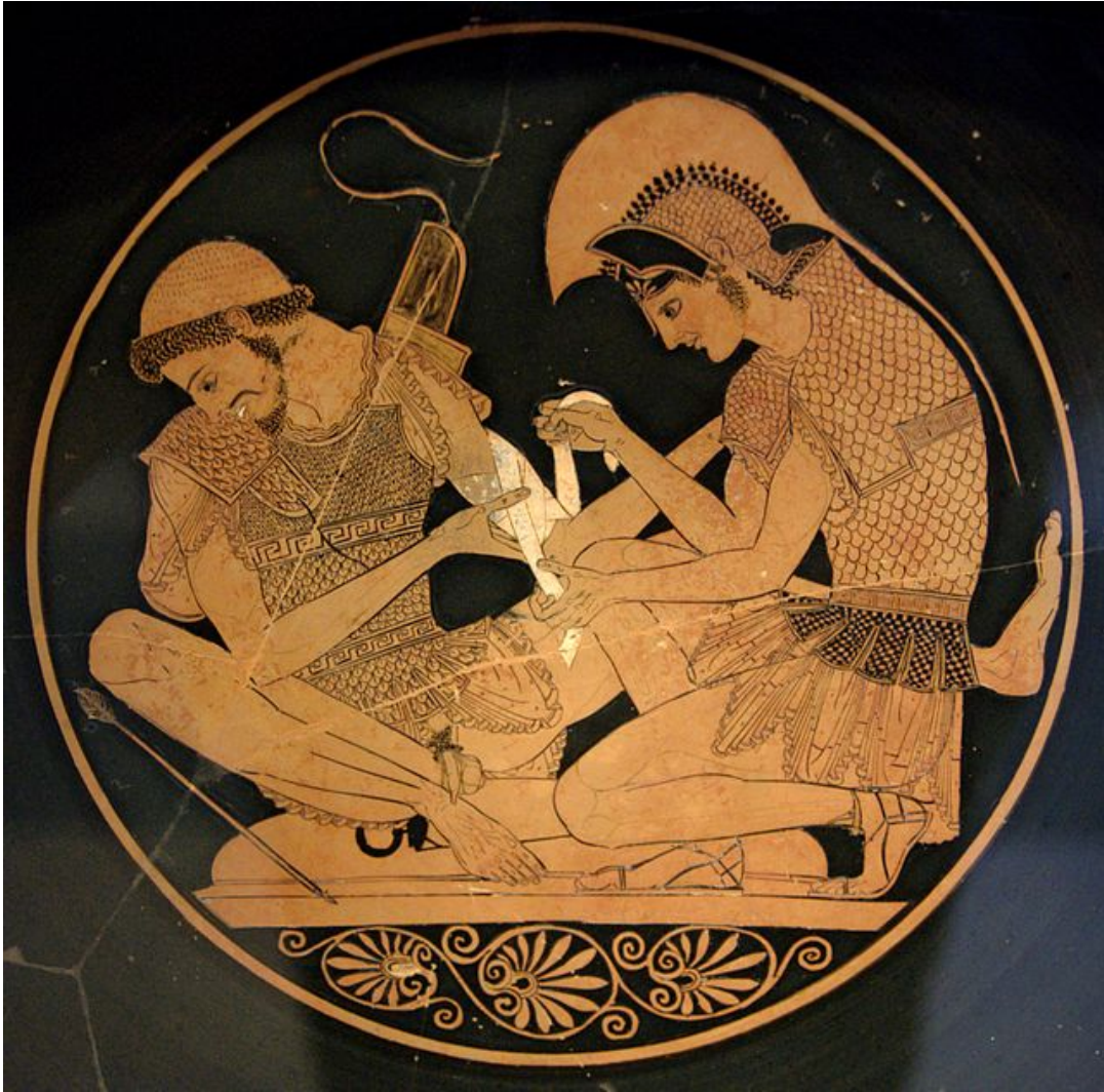
FIGURE 4 ACHILLES TENDING PATROCLUS WOUNDED BY AN ARROW, ATTIC RED-FIGURE KYLIX, C. 500 BC

In the forenoon the fight is equal, but Agamemnon turns the fortune of the day towards the Achaeans until he gets wounded and leaves the field—Hector then drives everything before him till he is wounded by Diomedes—Paris wounds Diomedes—Ulysses, Nestor, and Idomeneus perform prodigies of valour—Machaon is wounded—Nestor drives him off in his chariot—Achilles sees the pair driving towards the camp and sends Patroclus to ask who it is that is wounded—This is the beginning of evil for Patroclus—Nestor makes a long speech.