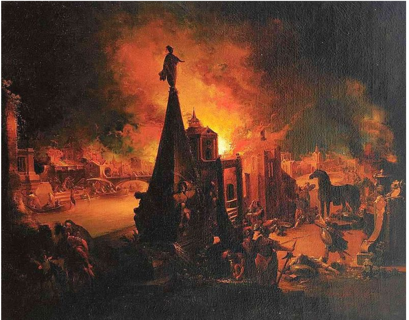
FIGURE 1 THE BURNING OF TROY (CA. 1759-62) BY JOHANN GEORG TRAUTMANN