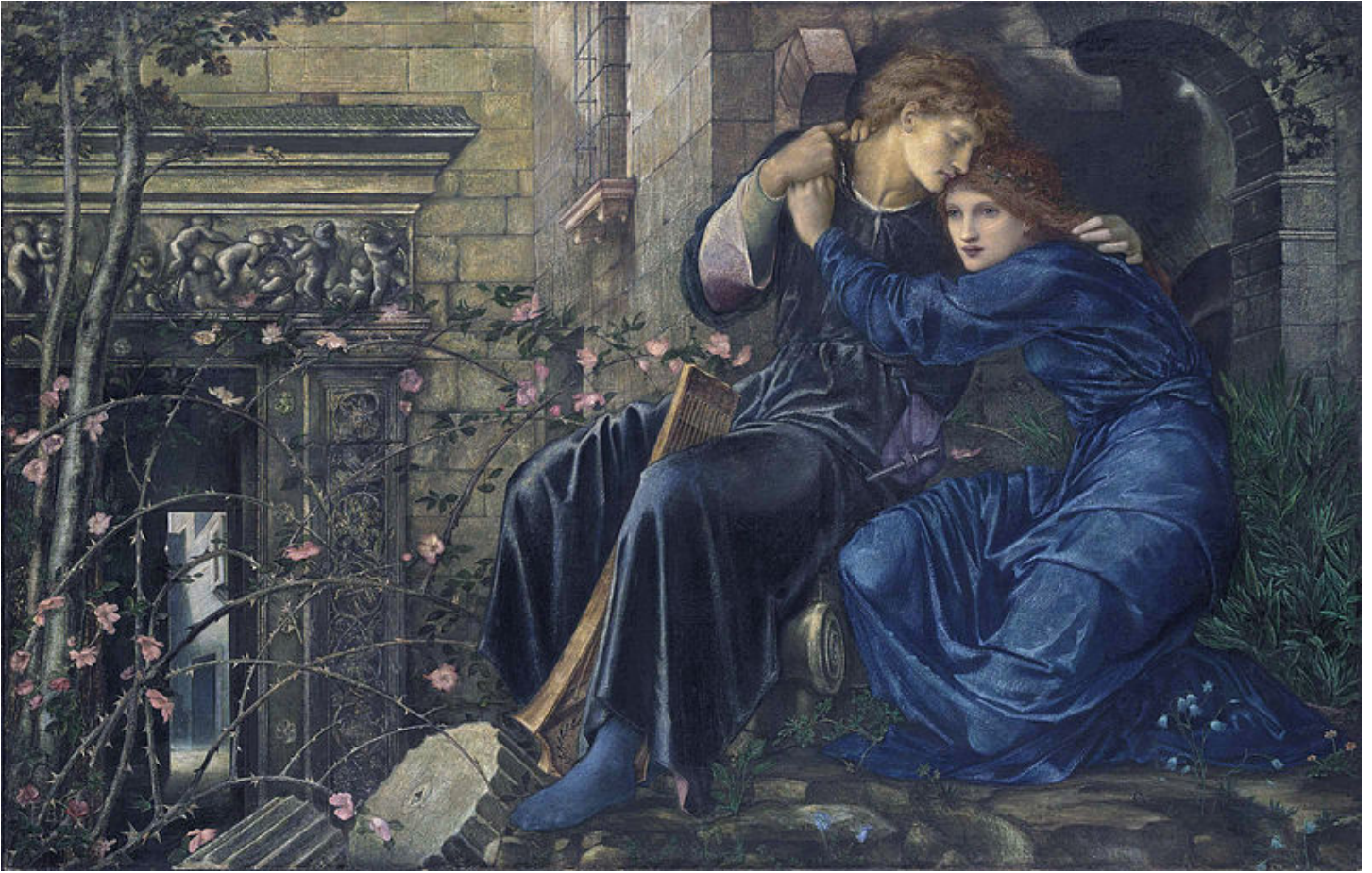
FIGURE 4 EDWARD BURNE-JONES, LOVE AMONG THE RUINS, 1873 18

Amongst the tales I tell you once again, I would not forget the Lay of the Were-Wolf. Such beasts as he are known in every land. Bisclavaret he is named in Brittany; whilst the Norman calls him Garwal.