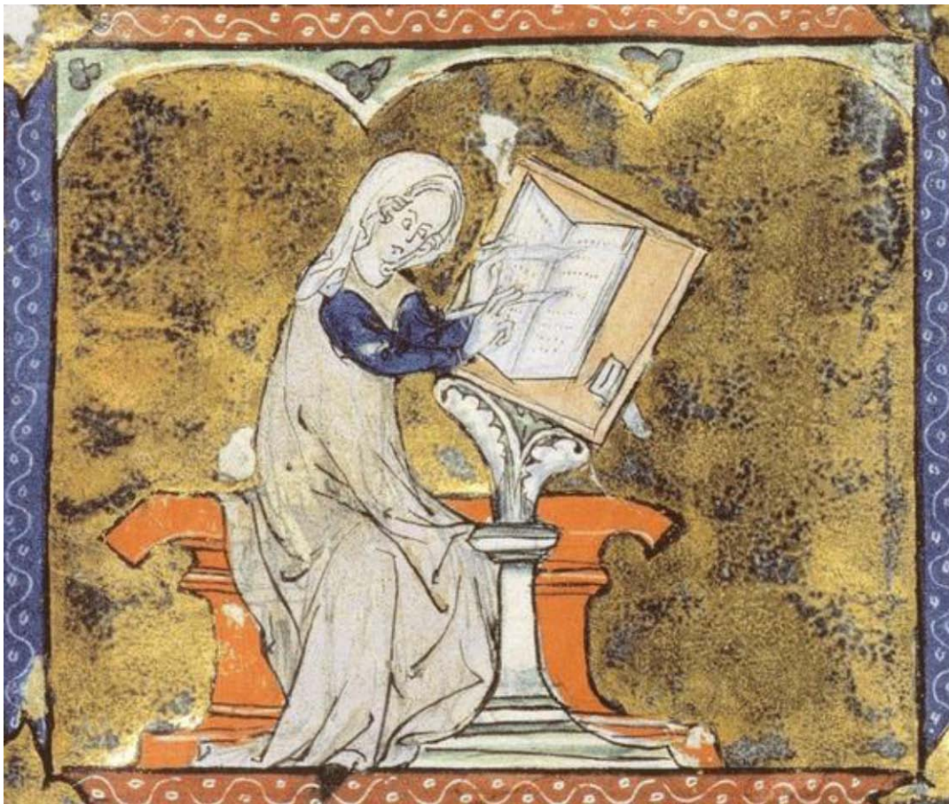
Figure 1 Marie de France, from an illuminated manuscript 1