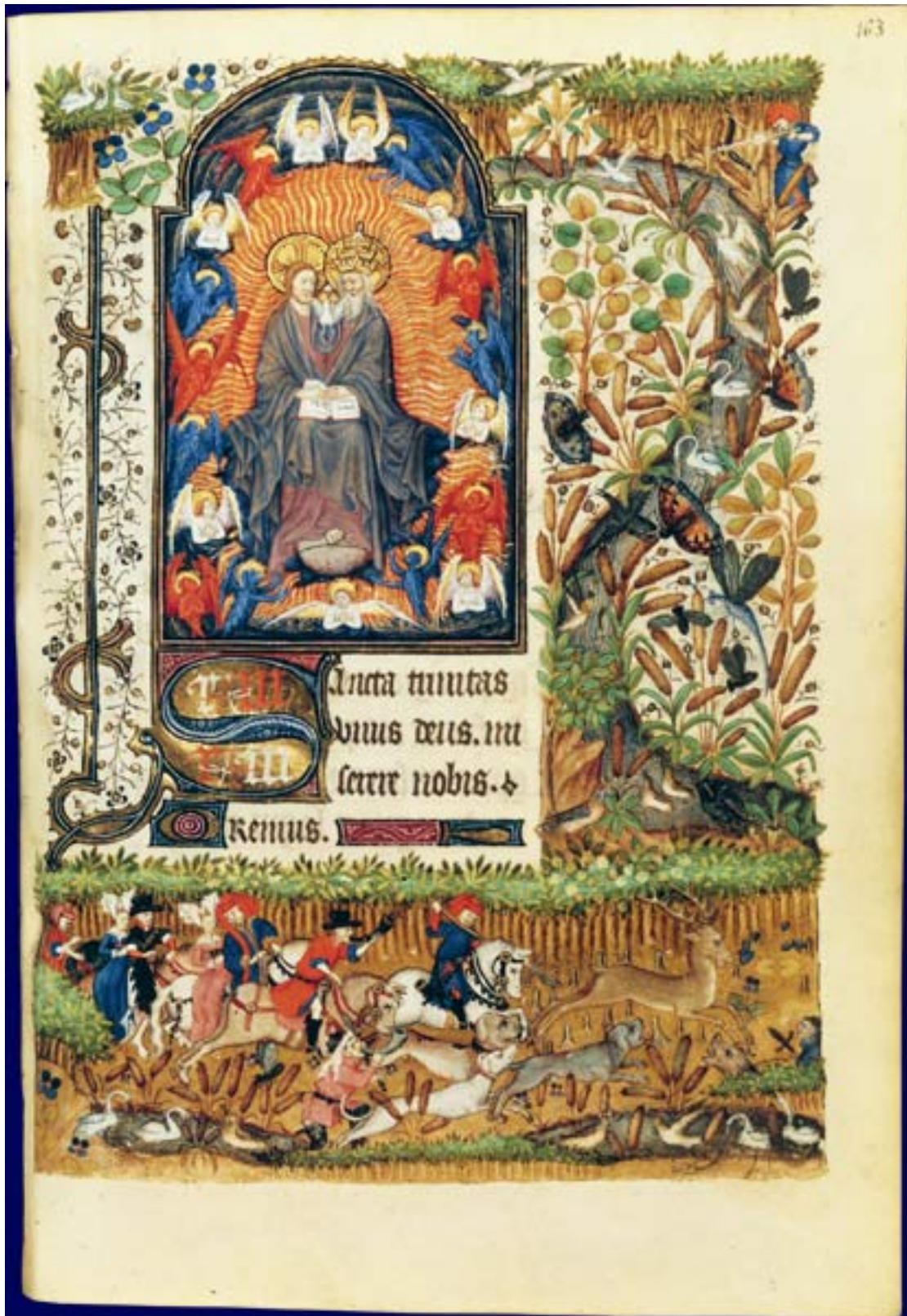
FIGURE 2 HUNTING A STAG IN THE FOREST, 1430 2